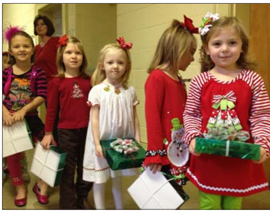
Children's House Christmas Program