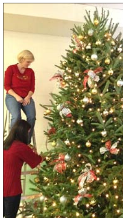
"Old- Fashioned Christmas" in the Fellowship Hall