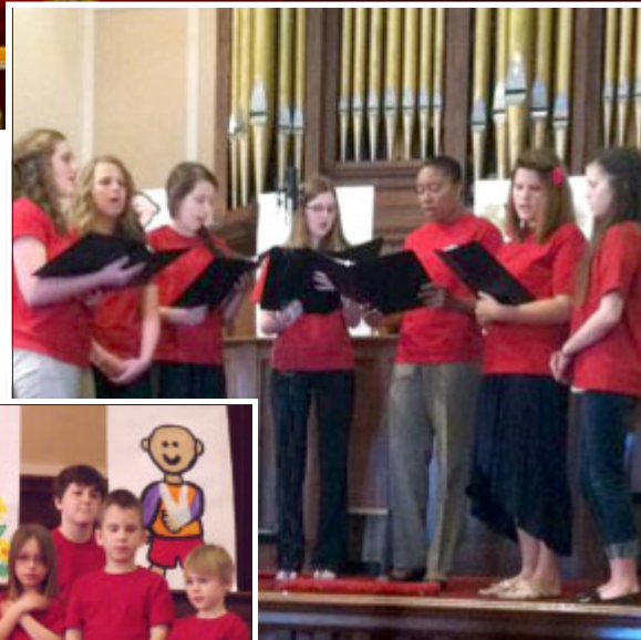
"It's OK to Be Me!"