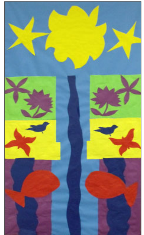
"Creation" – Made by our Youth Sunday school class