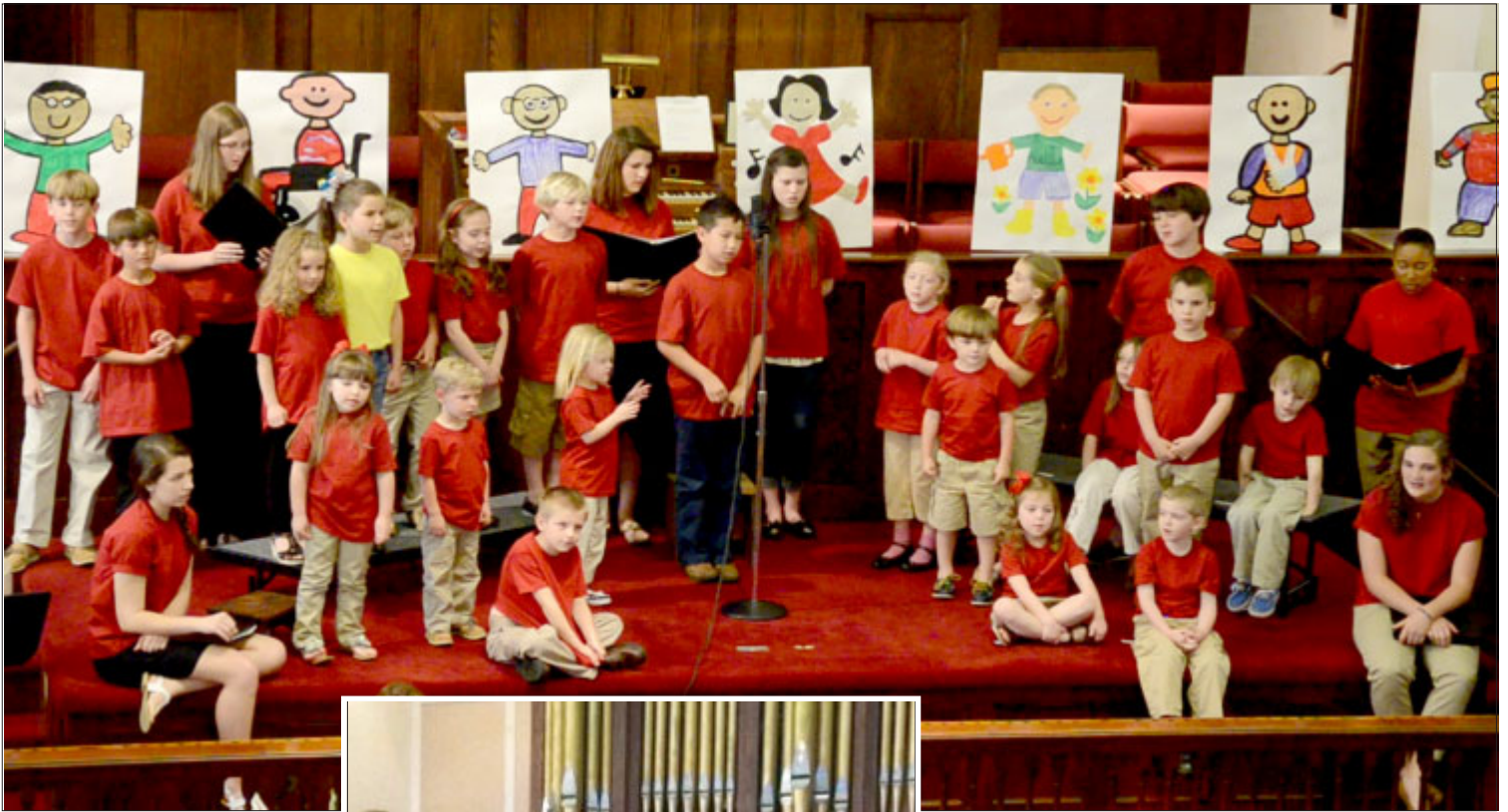
Children and Youth Lead the Worship Service